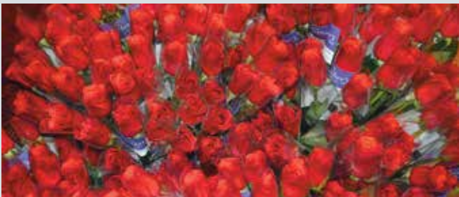
UnitedHealthcare Community Plan of Hawai'i distributed close to 400 long stemmed roses at the New Hope Oahu ministries on Mother's Day.