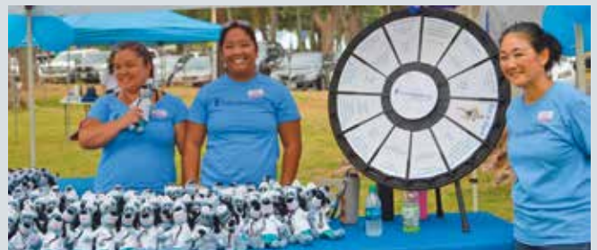
UnitedHealthcare Community Plan staff supported the March of Dimes across all islands. They have raised close to $6,000 so far through walks, and continue to raise funds.