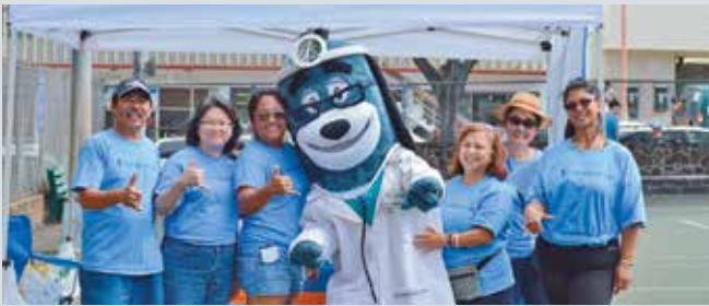
Volunteers and Dr. Health E. Hound handed out special treats to keiki at the Kaimuki District Park Annual Easter Egg Hunt held on March 28.