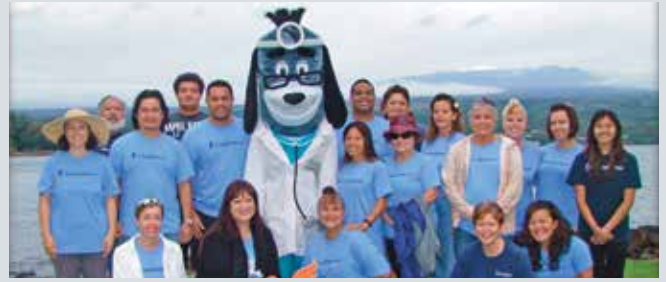
Staff from East Hawai'i on the Big Island volunteered at the 18th annual Hilo Heart & Stroke Walk held on March 7.