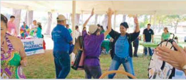
UnitedHealthcare staff volunteers were at the 23rd annual Filipino Fiesta on May 9 to share physical activity games with both young and old eventgoers.