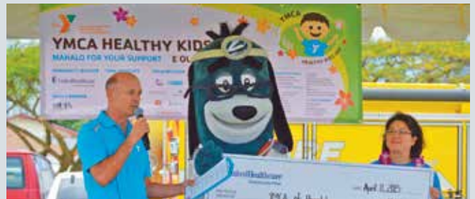
As main title sponsor of the YMCA Healthy Kids Day on Oahu, UnitedHealthcare Community Plan presented the YMCA with a $10,000 check on April 11.