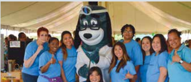
Our field service coordinators attended the 10th annual Wai'anae Keiki Spring fest on May 10 on the beautiful Wai'anae coast.