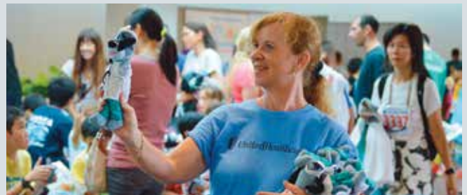
On February 14th, keiki 12 and under competed in a 2-mile run around the Neal S. Blaisdell Center in the 2015 Keiki Great Aloha Run. UnitedHealthcare in part sponsored the event.